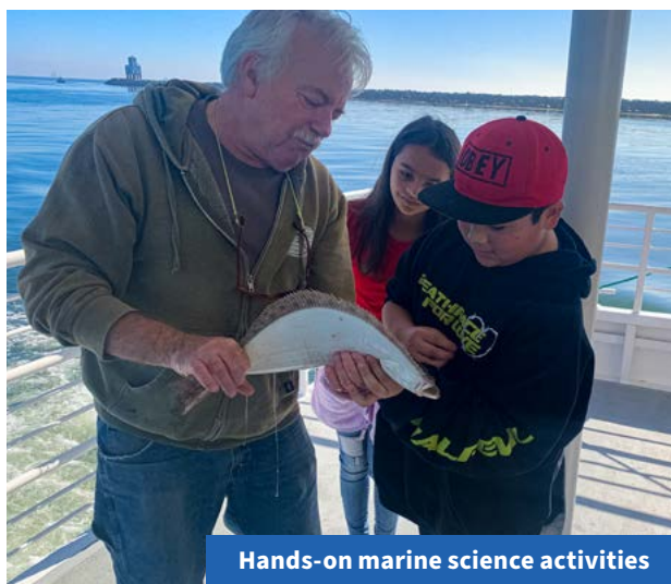
Hands-on marine science activities