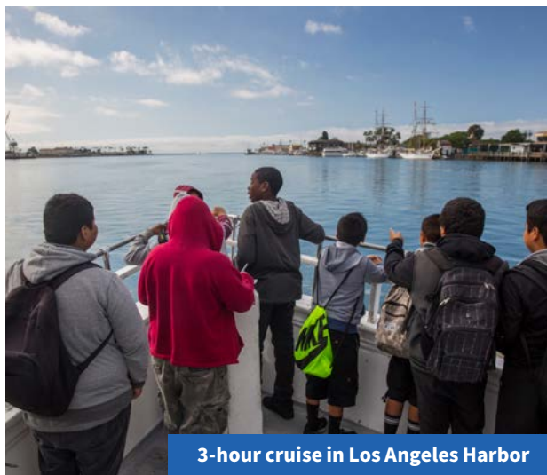
3-hour cruise in Los Angeles Harbor